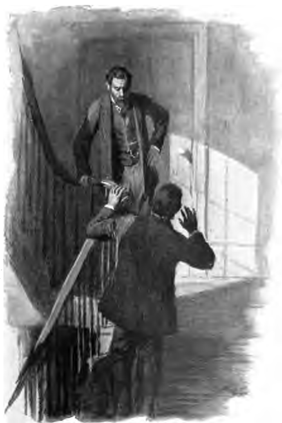
“FACE TO FACE”